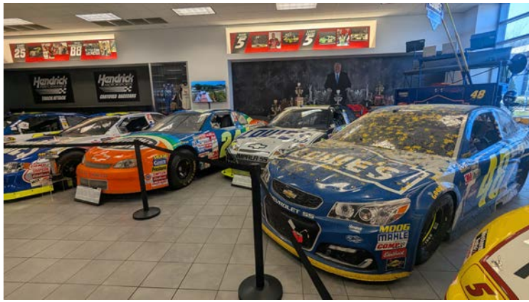
Touring the Hendrick's private collection