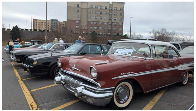
Car display at the hotel