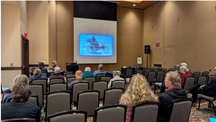
Women in Automotive History Presentation