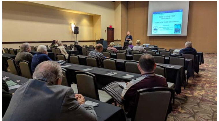
Road Map to Your Next National Event seminar

made a trip to Dairy Queen for lunch with Vicki and Art. It was a nice, low-key way to fuel up before the next adventure.