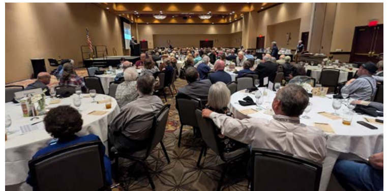
Regions and Chapters dinner

The evening continued with the Regions and