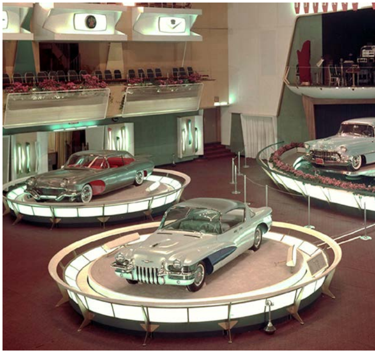
The 1955 GM Motorama display in the Waldorf Astoria shows La Salle II concept cars.