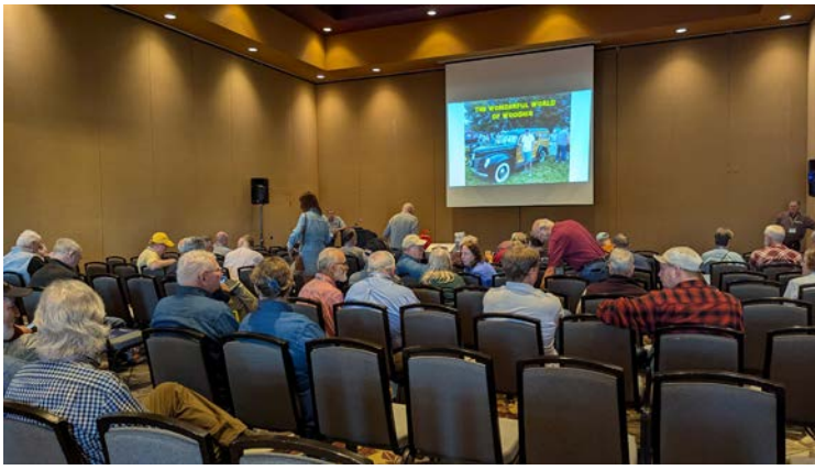
The Wonderful World of Woodies