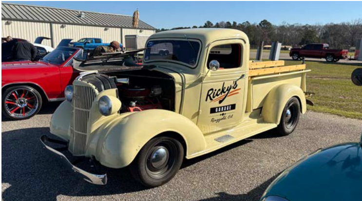
Cars at the show