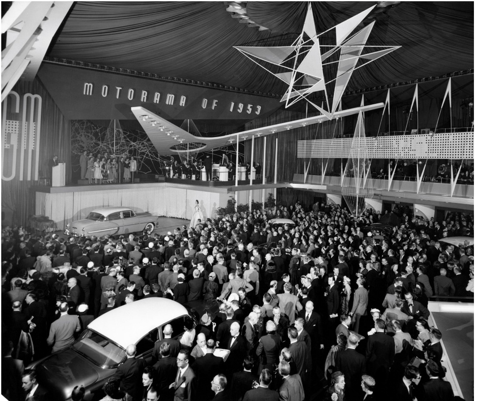
The 1953 GM Motorama display in the Waldorf Astoria New York.