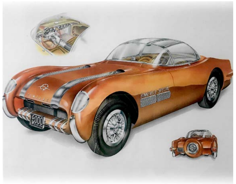
An artist's rendering of the 1954 Bonneville Special bubble top.