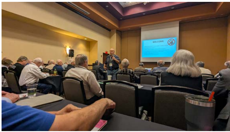
Master Judging School