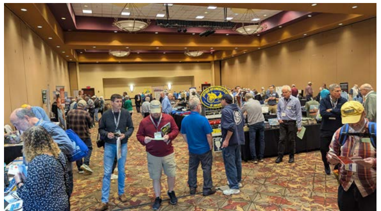
Trade Show was always packed

As the day wound down, we attended the evening program, starting with the Directors' Welcome Reception at the hotel. The menu was a carb lover's dream—a pasta bar with all the fixings and a tempting array of desserts. But this wasn't just about food. It was a moment for local Regions and Chapters to come together and make their annual donations to