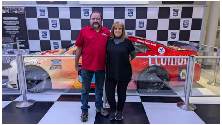
NASCAR Hall of Fame