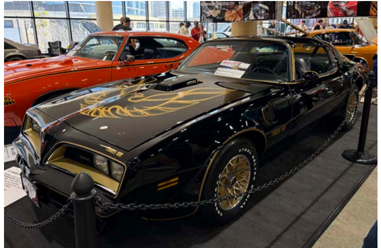
Jeff Loebler's car at the World of Wheels