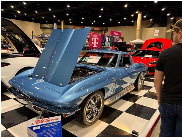
Some very nice cars at World of Wheels