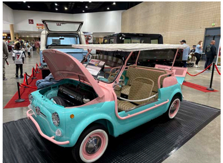
Most unusual car of World of Wheels