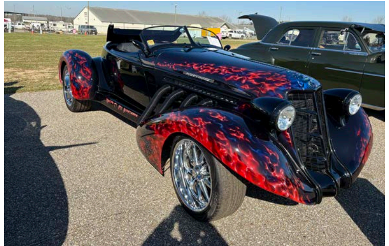
Custom car at the show