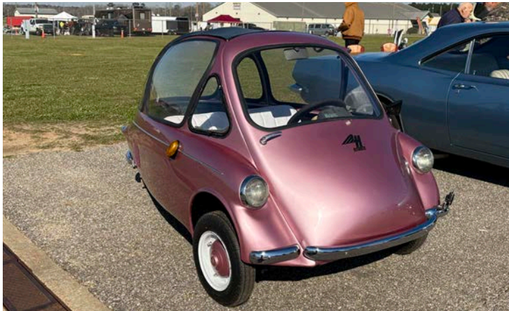
Most unique car at the show