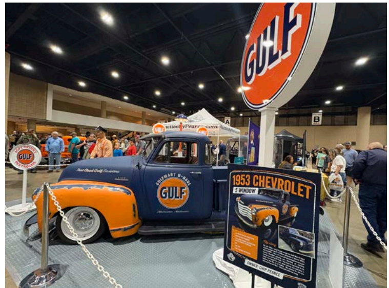
Cool display at World of Wheels