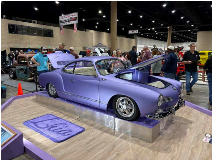
Custom Car at World of Wheels