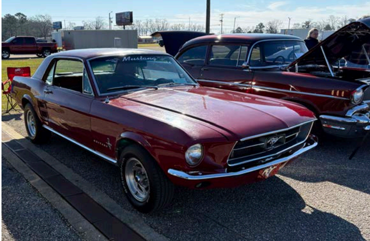
Cars at the show