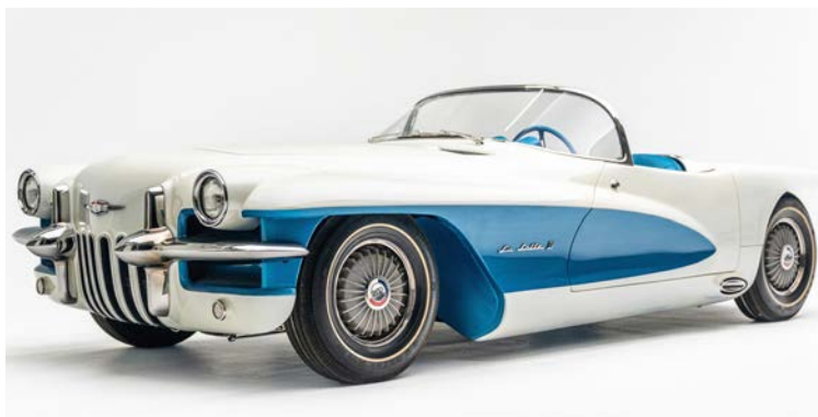
The 1955 LaSalle II Roadster concept.

The Marvelous Motorama exhibit will feature six cars, including three rescued from near destruction at Warhoops Auto and Truck Parts in Sterling Heights, Mich. After their time in the spotlight, most “Dream Cars” were sent to scrap yards to be cut apart and crushed. Four cars were saved by Warhoops employees and squirreled away among junked car bodies. After hearing rumors about the saved “Dream Cars” in the mid-1980s, collector Joe Bortz purchased the four cars from the scrapyards.