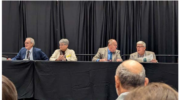
Getting ready for the award presentation

Chapters Dinner, a chance to relax and enjoy great company. But the fun didn't stop there. After the dinner, we stepped into the hallway and were transported to the Roaring '20s Speakeasy Casino Night. The atmosphere was electric—cards flying, people laughing, and the excitement palpable. After two hours of playing, I was still holding onto $10,000 to trade for raffle tickets. It was a night full of surprises, laughter, and a little bit of luck!