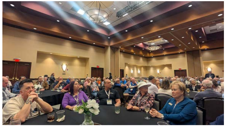
Board of Directors meet and greet