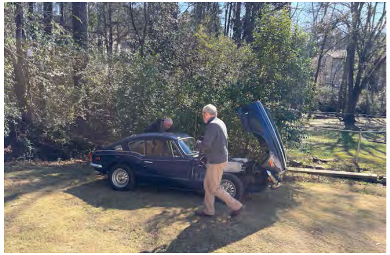
Getting the car ready for another shot