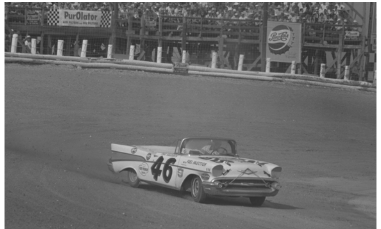
Chevy Bel Air was photographed on track at Daytona.

The 1957 Chevrolet was a monster on the track, winning 49 NASCAR Grand National races, more than any other car in NASCAR history. This 1957