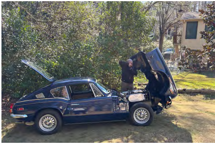
West is taking engine shots