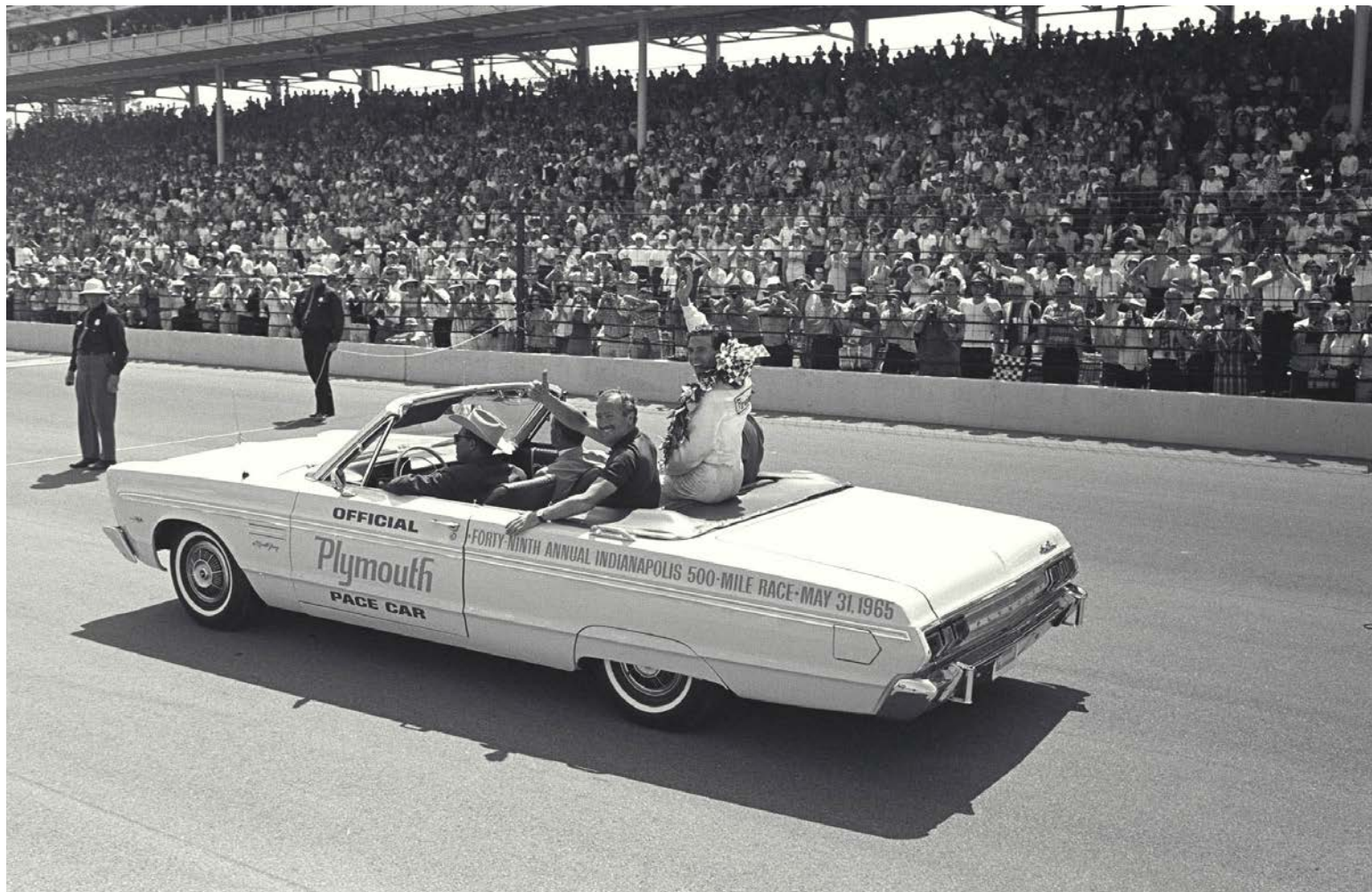
At the 1965 Indy 500, it was ironic that race winner, Ford driver Jim Clark, took his victory lap in the Plymouth Pace Car. Colin Chapman is on the left.