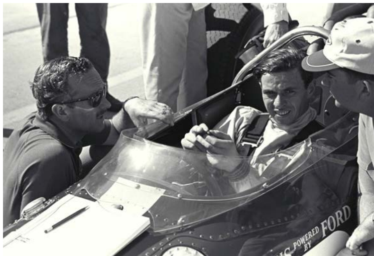
Colin Chapman (left), Jim Clark (center), and the tire engineer confer before practice at the 1965 Indy 500.

“Factory equipment included buckets seats, a center console with tachometer, power steering, power brakes, power top with boot cover, front and rear bumper guards, full dash instrumentation, 14-inch redline tires and full wheel covers, a glove box light, windshield washer, seatbelts, and Plymouth Transaudio AM radio.