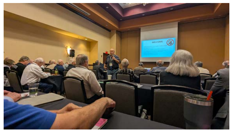
Master Judging School