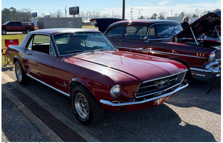
Cars at the show

The event was held at the Dothan National Peanut Festival Grounds. There was an antique show indoors, a decent sized swap meet outside and the car show. There were about 100 cars in the show