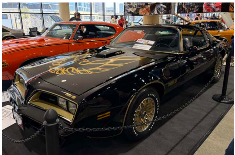
Jeff Loebler's car at the World of Wheels