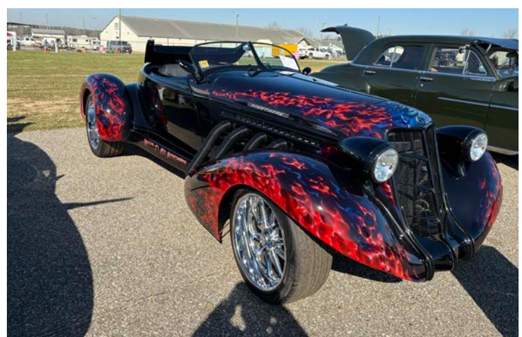
Custom car at the show