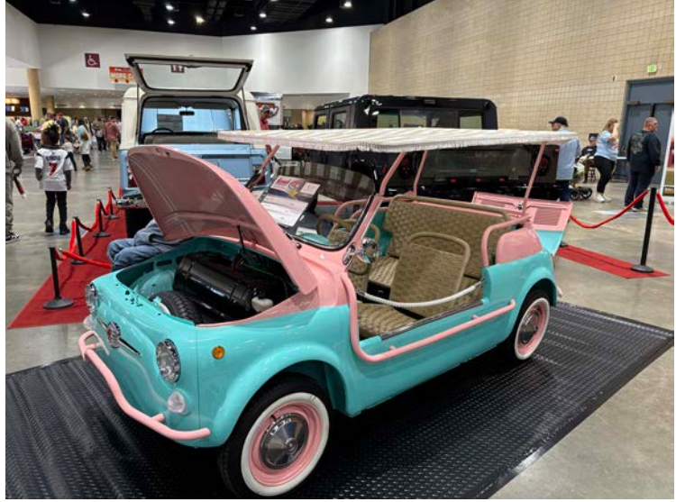
Most unusual car of World of Wheels