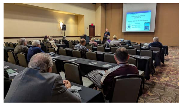
Road Map to Your Next National Event seminar

This year's trade show had a fun twist—prizes for visiting every booth and collecting stamps. It turned the event into a bit of a scavenger hunt, making it more engaging and exciting. But beyond the thrill of the stamps, it gave us the chance to connect with the people manning each booth. Conversations flowed naturally as we stopped by, learning more about what they were offering while exchanging a few stories and insights along the way. It was a perfect balance