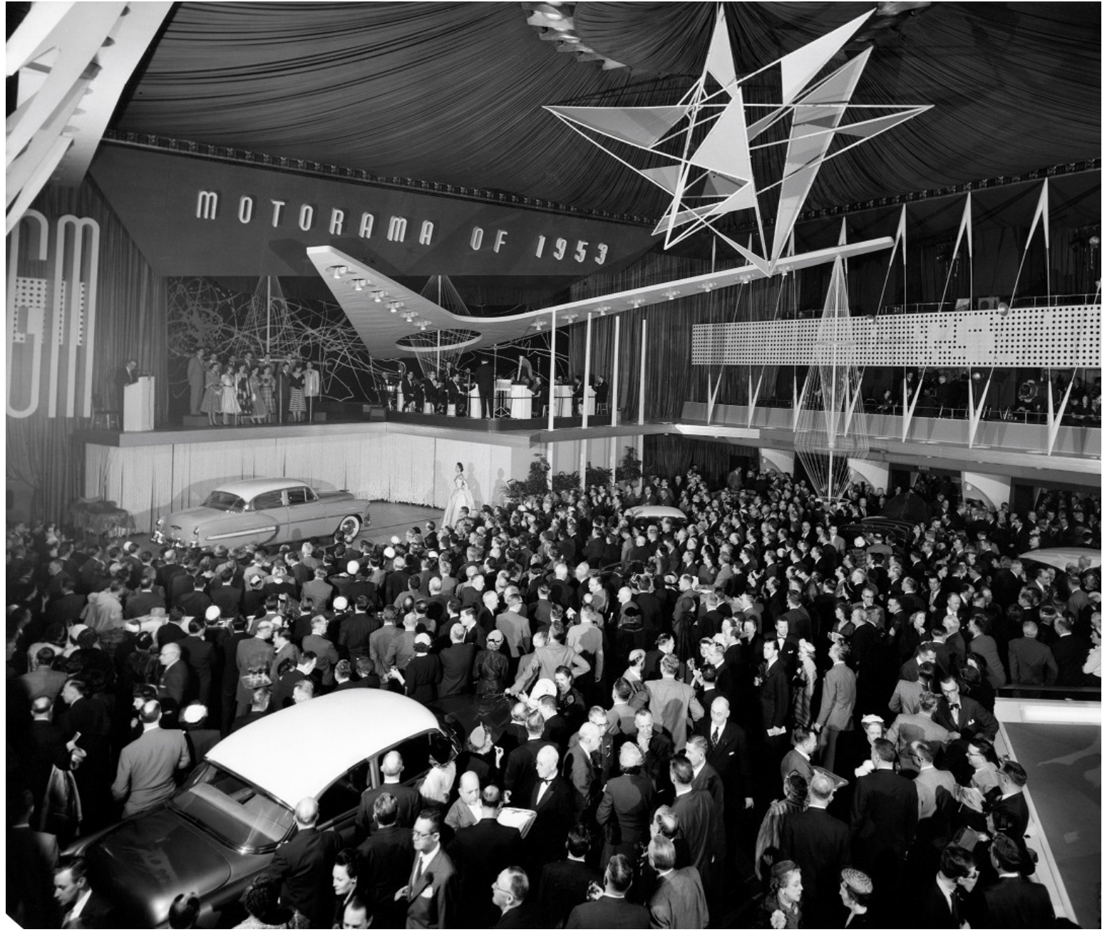
The 1953 GM Motorama display in the Waldorf Astoria New York.