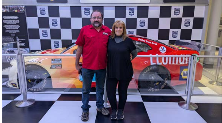
NASCAR Hall of Fame

The evening continued with the Regions and