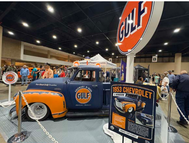
Cool display at World of Wheels