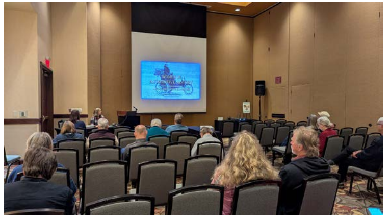
Women in Automotive History Presentation

either the AACA or the AACA Library. A great way to wrap up a day filled with passion for cars and community.