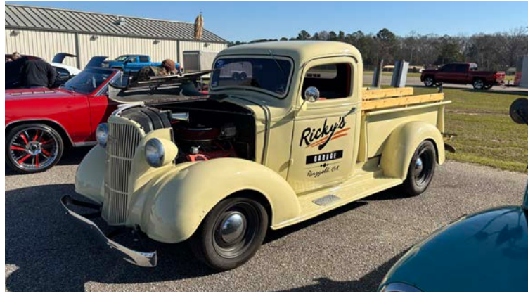
Cars at the show