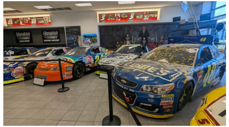
Touring the Hendrick's private collection