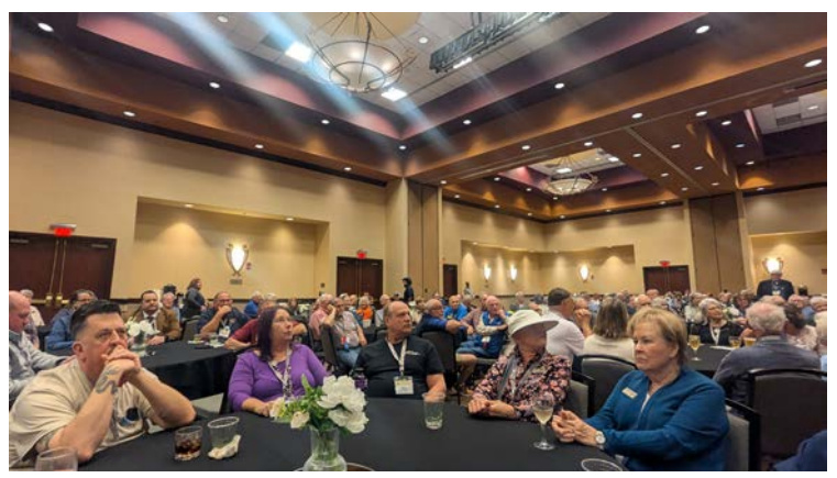
Board of Directors meet and greet