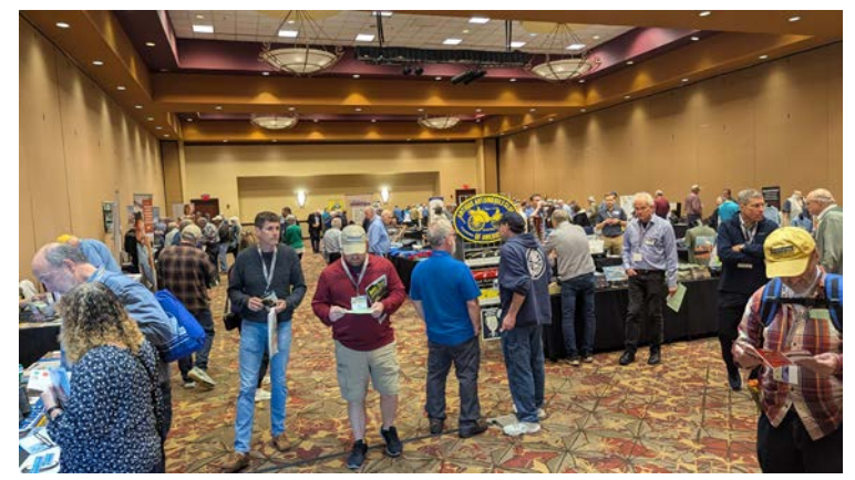
Trade Show was always packed

As the day wound down, we attended the evening program, starting with the Directors' Welcome Reception at the hotel. The menu was a carb lover's dream—a pasta bar with all the fixings and a tempting array of desserts. But this wasn't just about food. It was a moment for local Regions and Chapters to come together and make their annual donations to