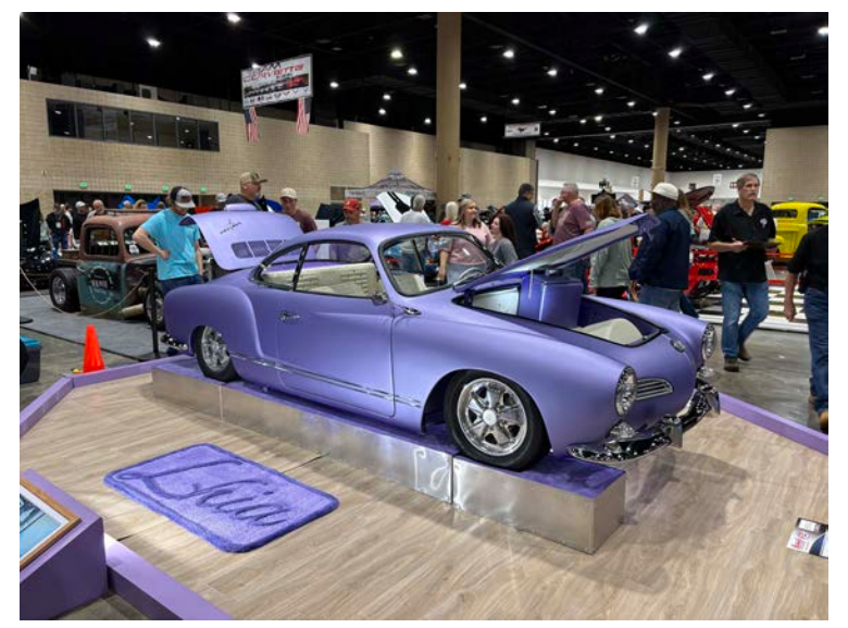
Custom Car at World of Wheels