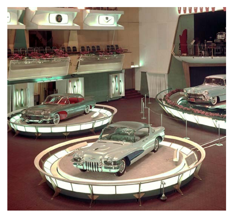
The 1955 GM Motorama display in the Waldorf Astoria shows La Salle II concept cars.