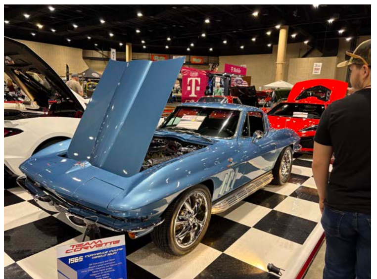
Some very nice cars at World of Wheels