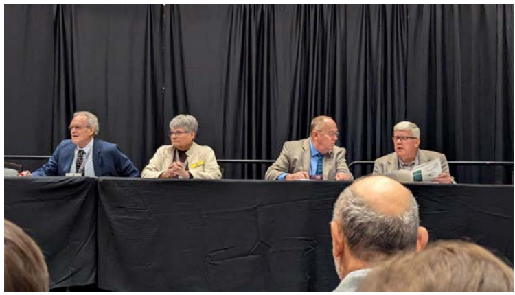
Getting ready for the award presentation