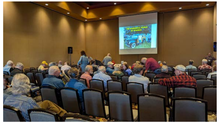
The Wonderful World of Woodies