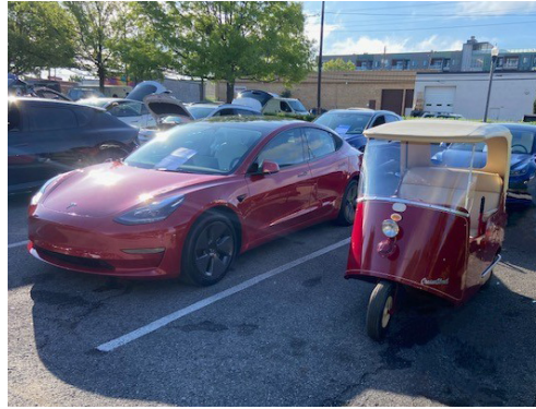
Tesla and Autoette

It was a beautiful day and the little Autoette was a big hit, especially with the kids!