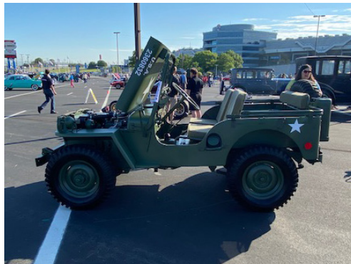
40s Military Jeep