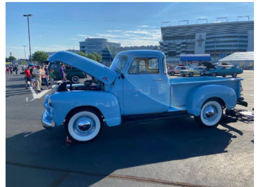
1953 Chevy 5 window