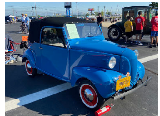
1939 Crossly Convertible