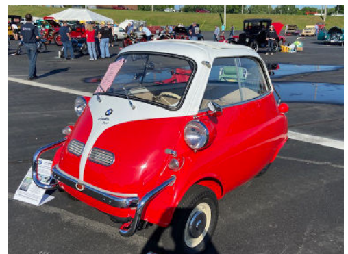
1957 BMW Isetta 300