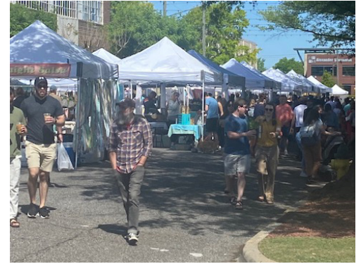
Vendors on the street