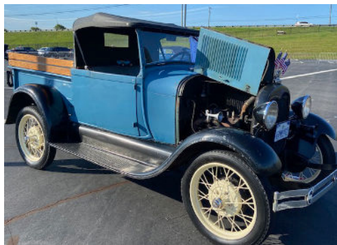
Model A Pickup Convertible