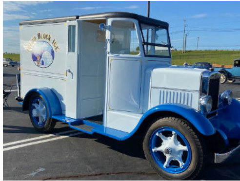
1936 Divco S Stand/Drive

There are special displays by vendors, your normal car related flea market stuff, and always interesting cars in the car corral. And of course, lots of food!