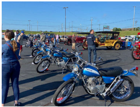
Motorcycles ready to be judged