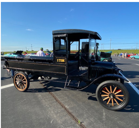
1 Ton Pickup