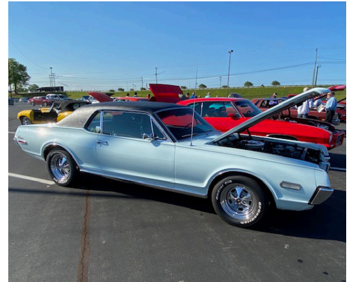
1968 Mercury Cougar