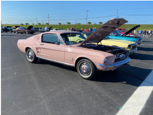
Pink 1967 Ford Mustang