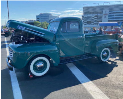
1950 Ford F1 Pickup