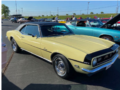
68 Chevy Camaro 327