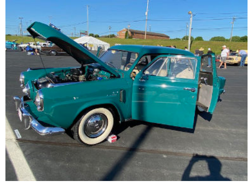
1951 Studebaker Commander with suicide doors